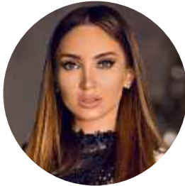
Talk Show Host FOX LA